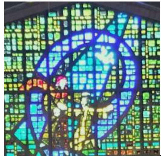
Our Lady of Victory Catholic Parish