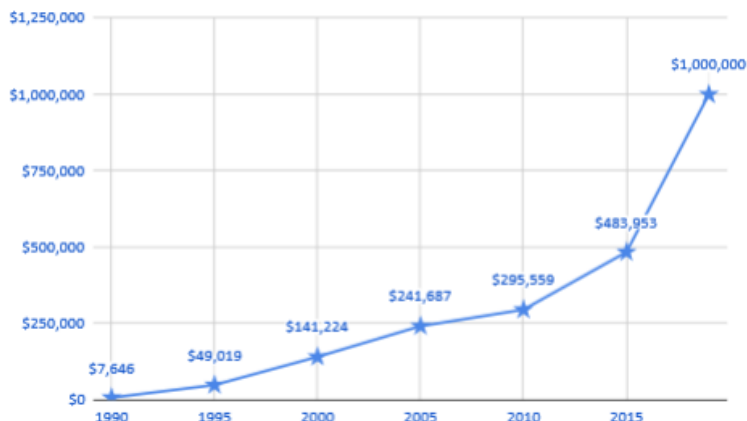
Endowment Value Reaches $1,000,000 in 2019

Please accept our sincerest THANK YOU for helping make this possible!