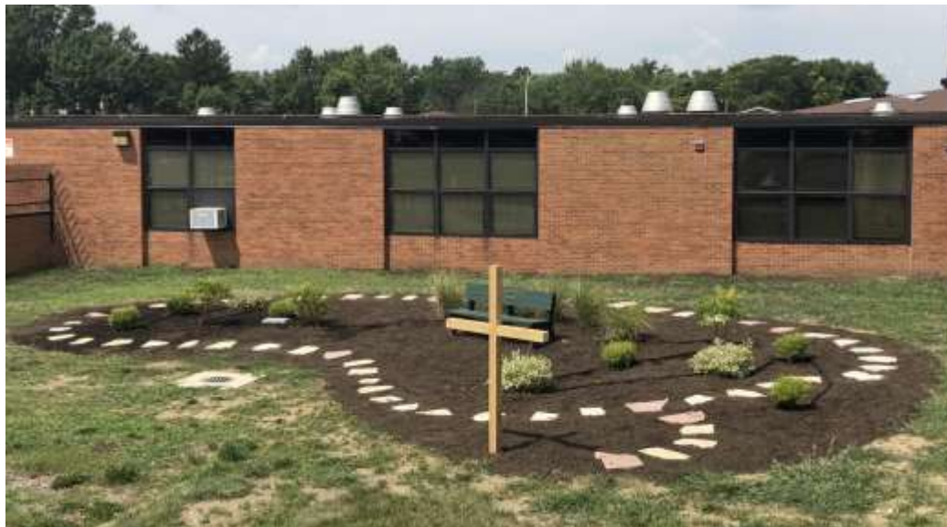
Rosary Themed Area near the JFK School Playground

Happy Feast Day, and as always we ask: Our Lady of Victory, pray for us!