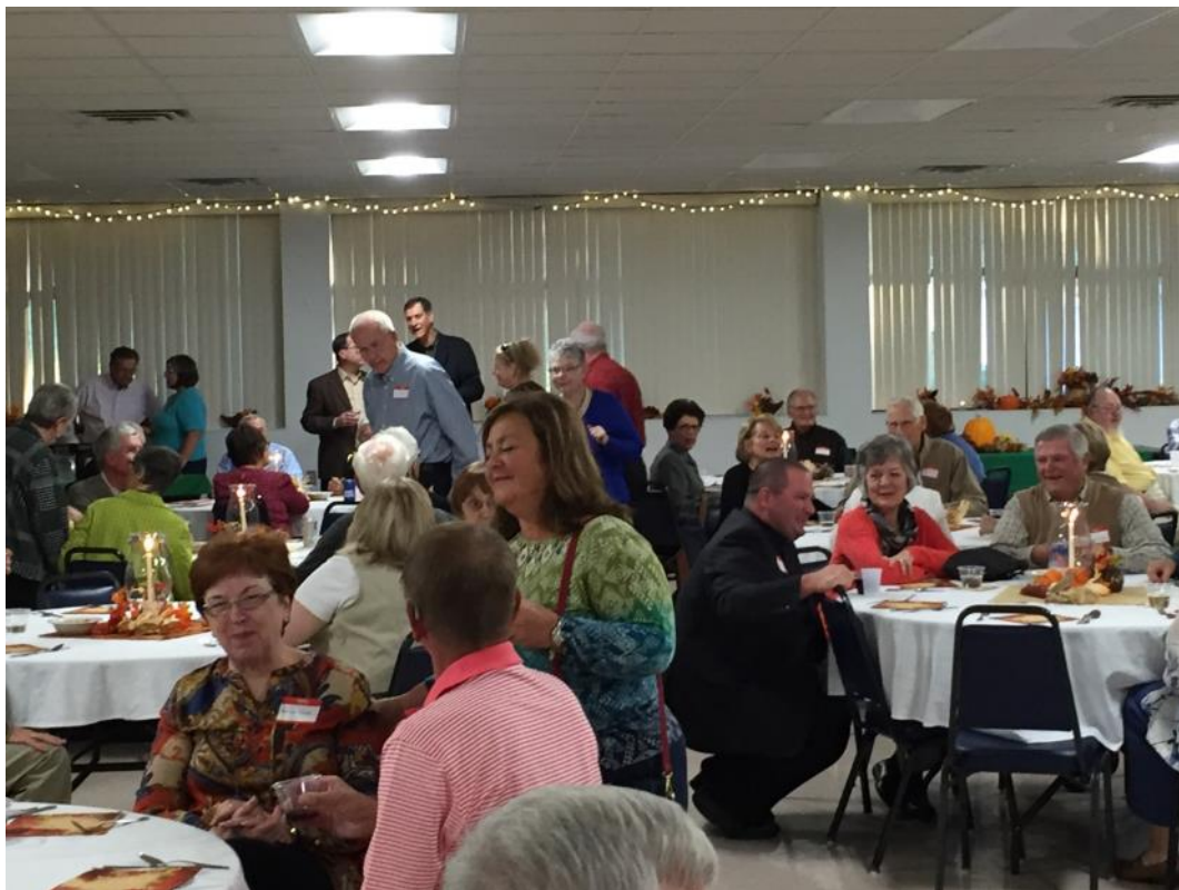
The Harvest Day Dinner celebrates OLV community and fellowship.

Save the Date: The 2017 Harvest Day Dinner will be held Sunday, October 8, 2017